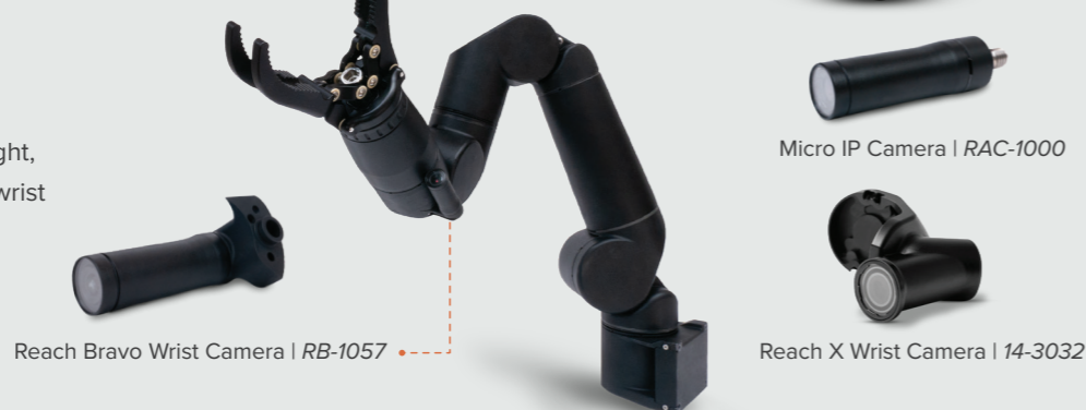
Micro IP Camera | RAC-1000

Experience greater perception during remote operations with compact, low-light, underwater cameras that attach to the wrist of your manipulator.